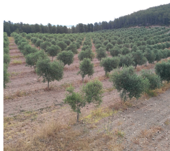
Olive trees, Spain