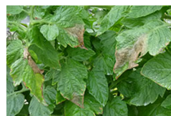
Fig. 1. Tomato leaves infected by B. cinerea .

In both tests, Bestcure® showed a high fungicidal activity against Botrytis cinerea observing at the doses from 1,5L/ha to 2L/h a significantly lower leaf incidence compared to the control without application. The significantly lower incidence in flowers treated with 1,5L/ha and 2L/h of Bestcure® is relevant, since it can be the origin of fruit infection, causing direct damages and serious economic losses in the harvest.