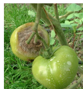
Fig. 2. Tomato fruits affected by B. cinerea .