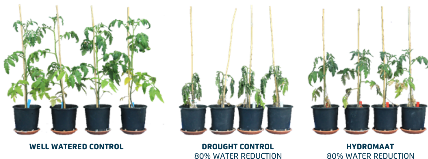
Figure. 1 Tomato plants at the end of the study (24 days of under drought stress)

Drought stress clearly affected growth and appearance in the control plants, whereas HydroMaat treated plants appeared more resistant to drought and with a better physiology (Figure. 1).